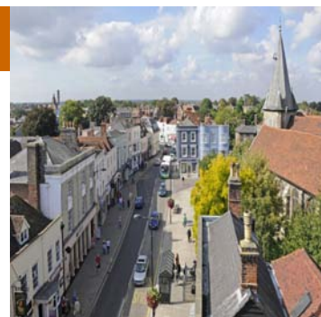
A view of the High Street looking South West is typical of the fine panorama from the roof

To meet this anticipated demand the management group have researched a wish list of items that includes post cards (We have a fine selection of professional quality pictures on file donated to the Friends by Bryan Panton), pencils and stationery items overprinted with Moot Hall, gift mugs, coasters for example.